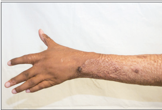
Figure 4. Sheet Skin Grafts and Meshed Grafts on a Patient's Hand and Arm.

Sheet skin grafts, shown on the patient's hand, are not meshed and have a much more natural appearance than meshed grafts, shown on the arm.